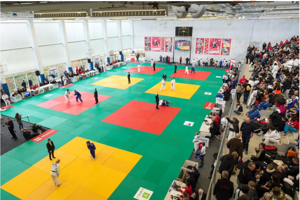
(Jean-Bernard DALLEAU's picture, XIX edition, 2017)