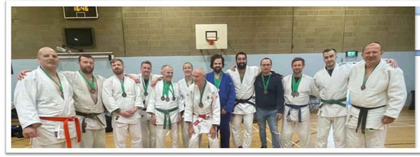
From Wild Geese